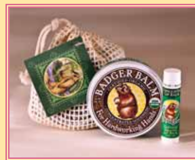
Badger Balm Gift Bag

*Olea Europaea ( Extra Virgin Olive ) Oil, *Cera Alba ( Beeswax ), and Nothing Else . * = Certified Organic