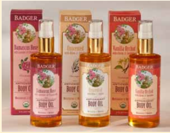
4oz Glass Bottles

Go beyond lotions and creams! Body Oils are the purest skin moisturizer: gentle, soothing, highly absorbent and completely compatible with your body's natural chemistry.