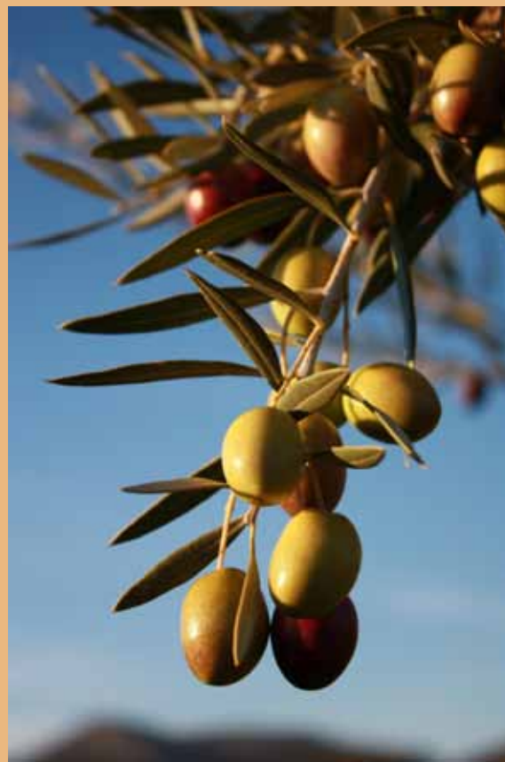
Andalusian Olives - used to make all of our products.

We're proud of our connection to our suppliers, and for their commitment to the environment in everything they do. And of course, we're proud to say that our balms contain the very same olive oil that is chosen by Michelin Star-awarded chefs in France and Spain.