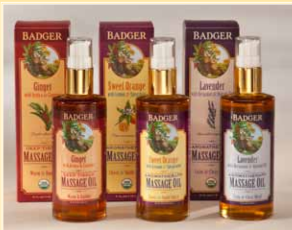
4oz Glass Bottles

Profoundly soothing and lightly infused with fragrant essential oils to soothe mind and body.